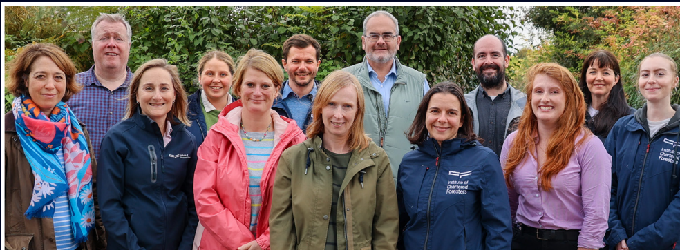
Staff Away Day to Shenmore Estate in Herefordshire

34 Emerging Leaders complete leadership programme funded by the Trees Call to Action Fund, Scottish Forestry and the Welsh Government.