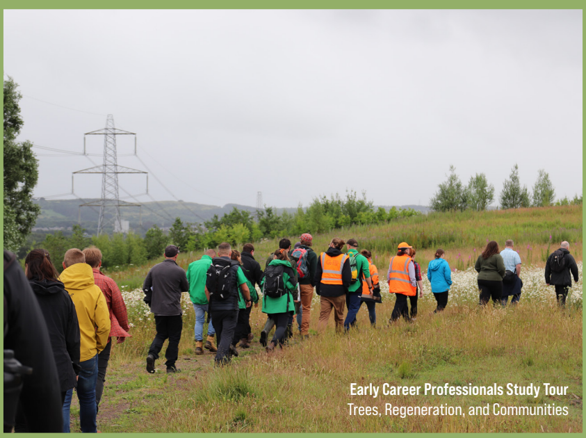
Early Career Professionals Study Tour Trees, Regeneration, and Communities