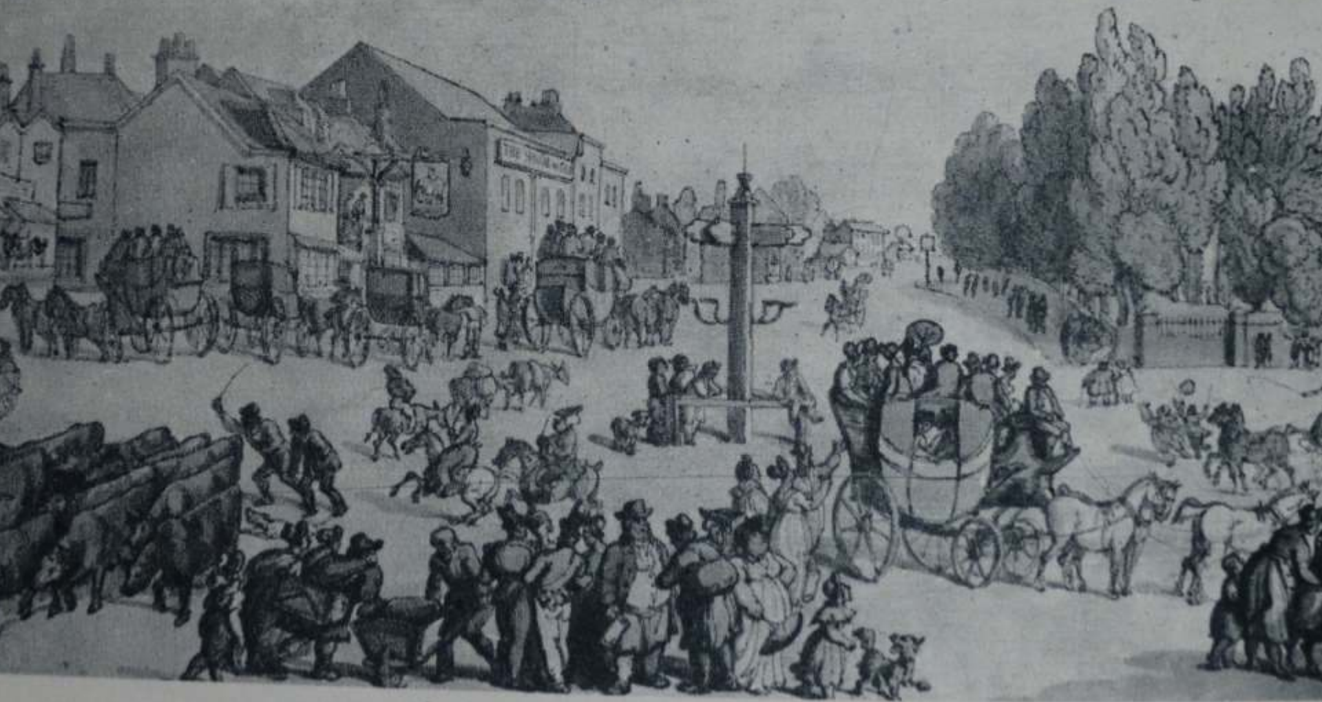
THE ELEPHANT AND CASTLE, LONDON Water colour by Thomas Rowlandson, 1756-1827